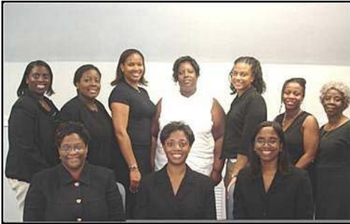
The Hartford Alumnae Chapter officers for the 2006-2008 biennium: